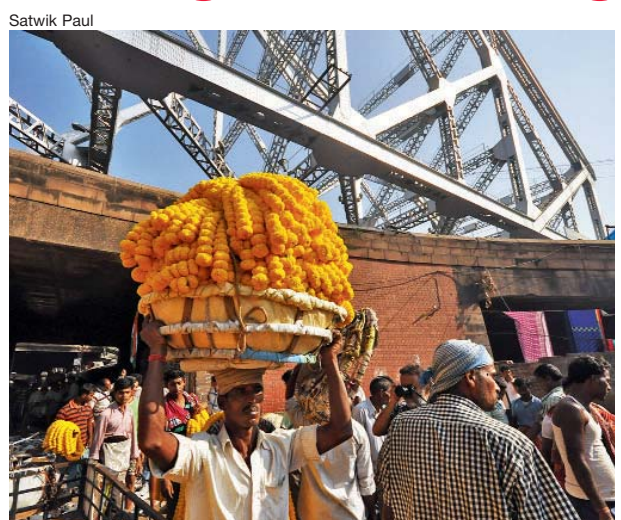
vendors at the flower market (also below)