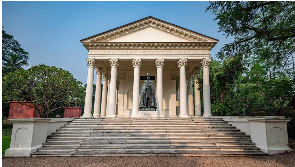
The cenotaph at Lat Bagan in Barrackpore

PUBLISHED 16.02.23, 02:41 PM