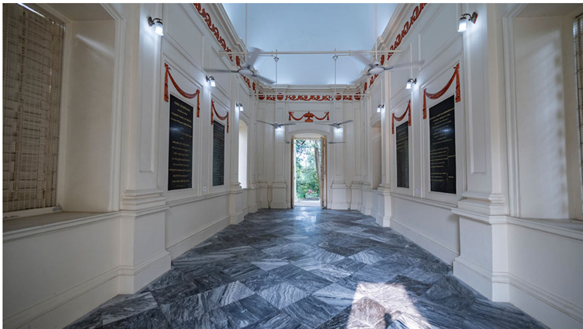
The room inside the cenotaph at Barrackpore

There is a single room with its front entrance right behind the statue of King George V. On top of the doorway, there is a signage that reads "To the memory of the Brave – Erected A.D. 1813". Once you enter through the door you will find yourself inside a rectangular room with marble flooring.