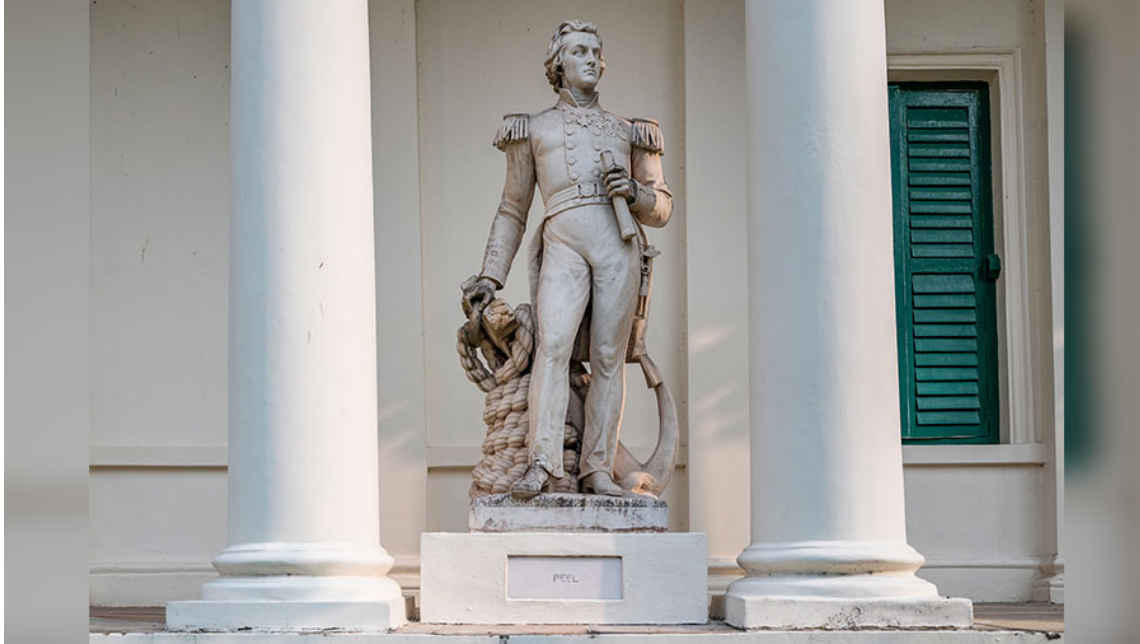
Statue of Captain Sir William Peel

Later, in the year 1844, an additional tablet was installed by Lord Ellenborough at the cenotaph. This was done to commemorate the fallen officers at Maharajpur and Punnar in Gwalior (Madhya Pradesh). This was not the only commemoration that was done for the fallen officers at Gwalior, another monument was also constructed in Calcutta (Kolkata) near Fort William facing the Hooghly River. This monument is still very much present and this is what we now know as the Gwalior Monument.