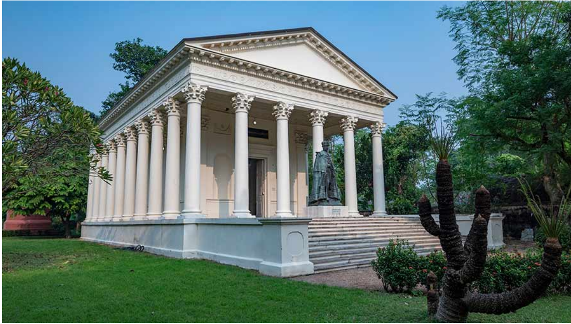
Another view of the cenotaph at Flagstaff House in Barrackpore

The cenotaph was constructed as a memorial to the fallen officers of the battle of Java and Isle de France between 1810 and 1811. Isle de France, what we now know as Mauritius, was under the French and it was often used as a base to disrupt trade by attacking British ships ferrying goods from the east to Europe. Isle de France was liberated from the French and was renamed back to its original name, Mauritius.