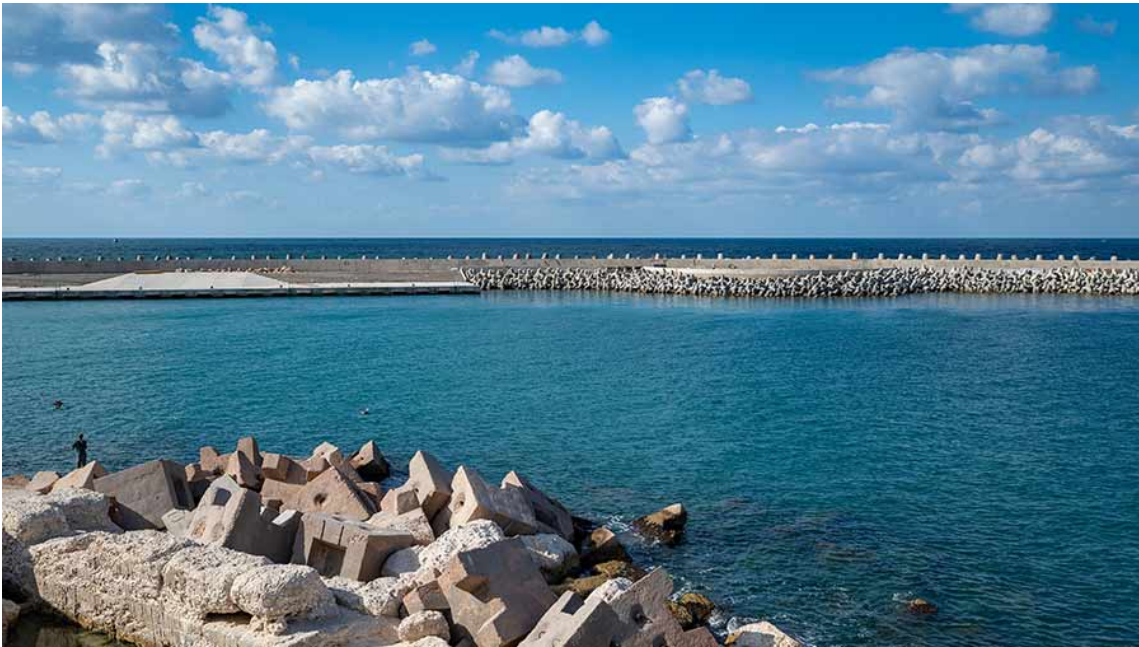
Blue waters of the Mediterranean Sea

Photography and videography are allowed inside the temple complex however you would need a special permit for commercial photography.