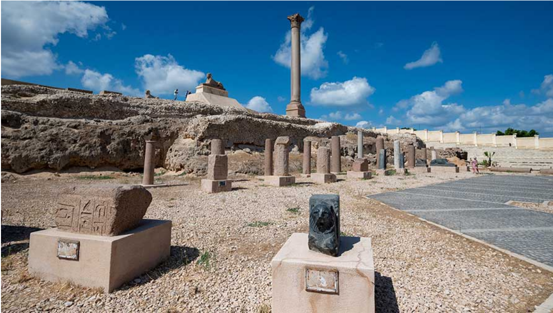
The Lion Statue and other remains from Serapeum of Alexandria

The one thing that still is very much visible and one of the prime attractions of this place is Pompey's Pillar. In Arabic, this pillar is referred to as ' Amud El-Sawari '. This is a Roman triumphal column, or a victory column, which was constructed to honour the Roman emperor Diocletian, who ruled between 298 AD to 302 AD.