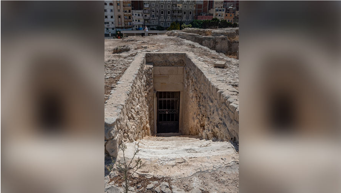
Passage leading to the catacombs below the Serapeum of Alexandria

If you are visiting Alexandria on a day trip from Cairo or spending a couple of days out there then this place is a must-visit. This place is located very near another tourist site, the Catacombs of Kom el Shoqafa.