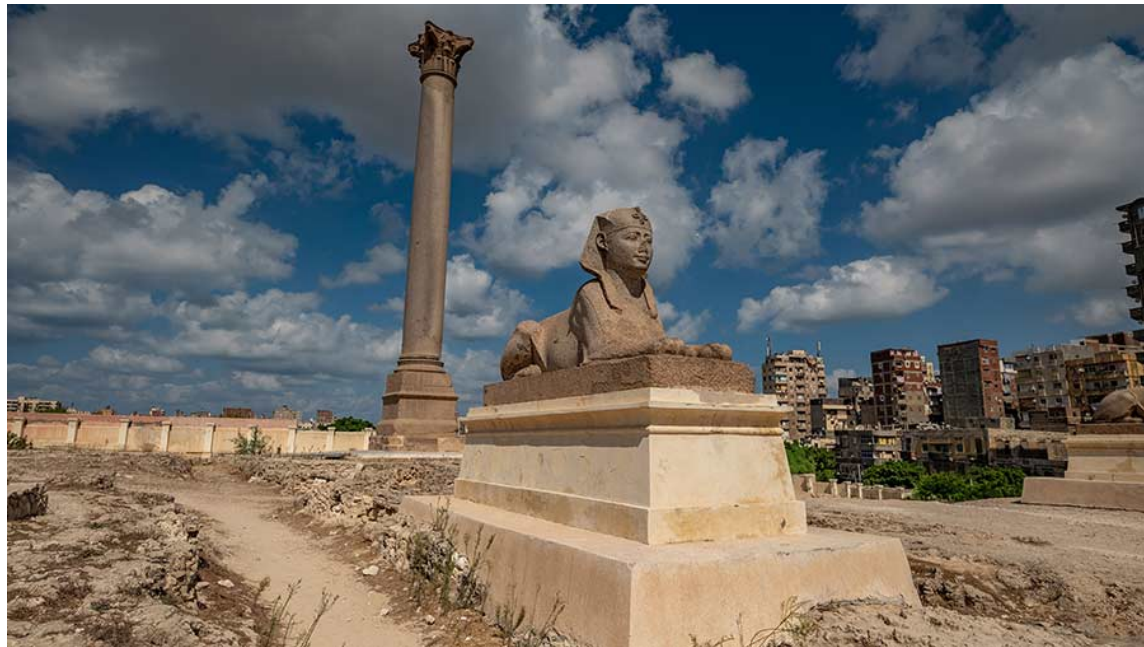
Pompey's Pillar with the Sphinx

SUBHADIP MUKHERJEE | PUBLISHED 04.02.23, 03:23 PM