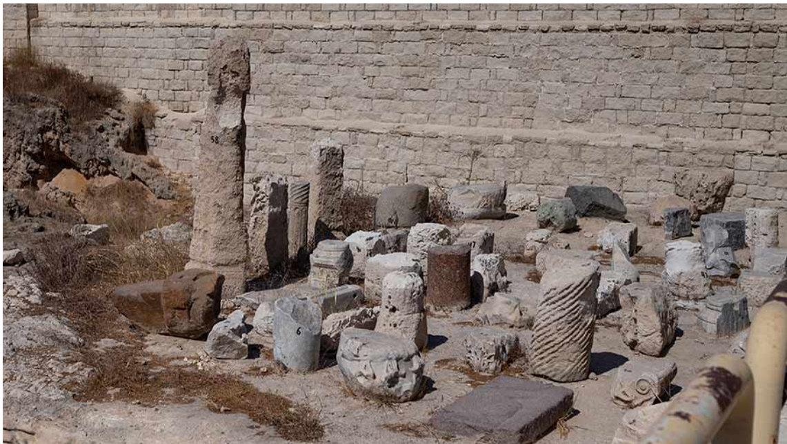
Remains of the pillar from the Serapeum of Alexandria

The base and the column shaft are made of pink granite which has been mined from Aswan while the capital is made of grey granite stones.