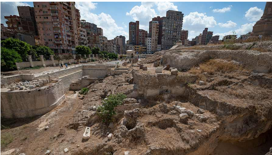
Excavated portions of the Serapeum of Alexandria

Diocletian managed to suppress a revolt in Alexandria by Domitius Domitianus. Finally, in the year 298 AD, he captured Alexandria by defeating and executing Aurelius Achilleus, the successor of Domitius Domitianus.