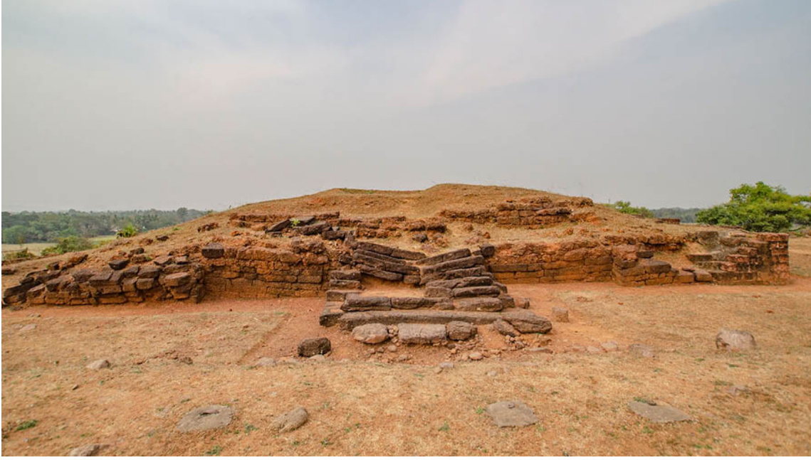
Remains of the main stupa on Langudi Hill

The problem faced by archaeologists was that none could perfectly pinpoint the location of Pushpagiri as excavations around Lalitgiri, Ratnagiri and Udayagiri did not reveal anything regarding Pushpagiri.