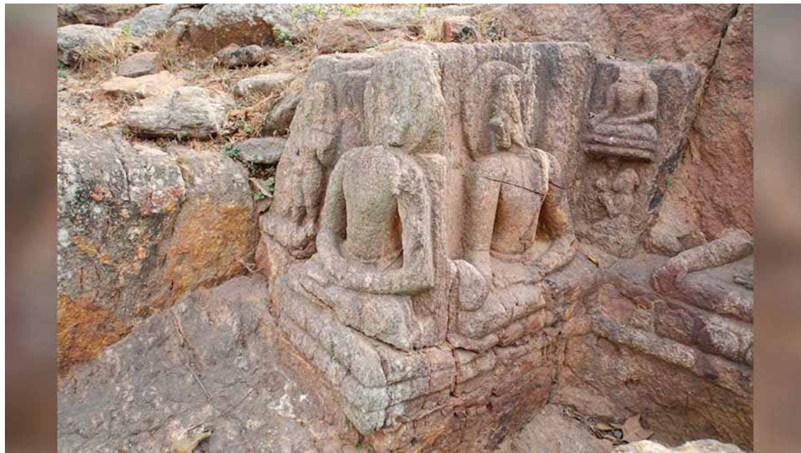
Rock-cut Buddhas on Langudi Hill

SUBHADIP MUKHERJEE | PUBLISHED 30.03.23, 03:16 PM