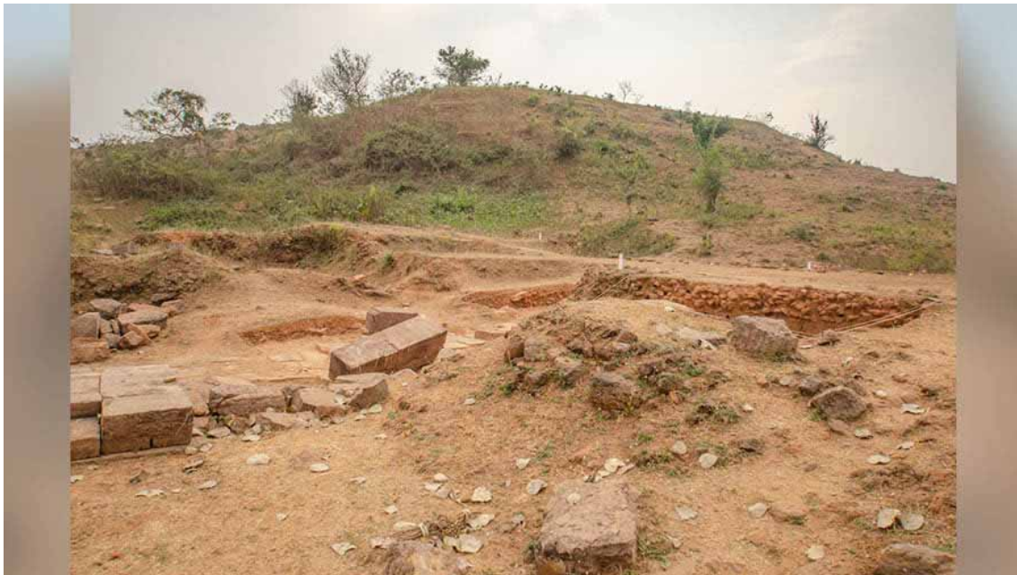
Excavation site on Langudi Hill

Towards the northeast section of the hill, you will find remains of recent excavations. All around this spot, you can make out the remains of some bigger structures, which most probably could have been the monastery.