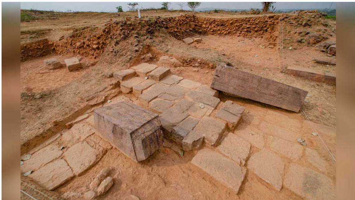
Excavation site on Langudi Hill

If you are visiting Lalitgiri, Ratnagiri and Udayagiri, then you can easily accommodate a short detour to Langudi Hill.