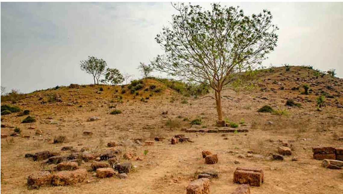
Scattered stone blocks on Langudi hill

Around 1995-1996, an excavation was carried out at Langudi Hill, which is located in the Jajpur district of Odisha in very close proximity to Lalitgiri, Ratnagiri and Udayagiri. When the excavation work was being carried out a small fragment of the inscription was discovered with the words Sri Pushpasabharagirayah written in Brahmi script, which when translated read something like this: “ The Illustrious mountains with the load of flowers ”. Another Brahmi inscription also discovered here had the words Konasakkhay which meant “ Off the staff (bearing) school (sect) ”.