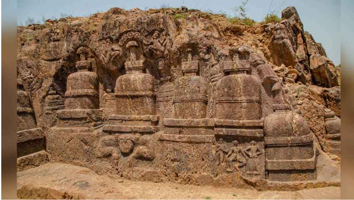
Rock-cut stupas and votive stupas on Langudi Hill

Historians after seeing these discoveries out here at Langudi Hill could safely conclude that this was the very Pu-Sie-Po-Ki-Li of Pushpagiri that Hiuen Tsang had visited when he traveled across this region of India.