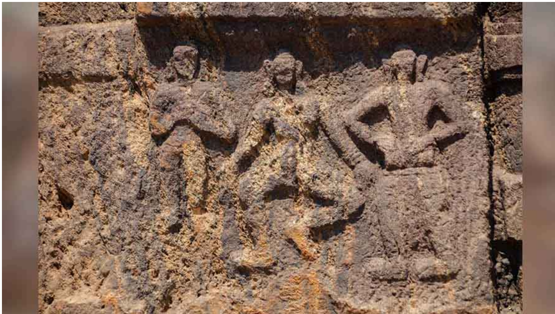
Figures of humans on rock-cut stupas and votive stupas

When you climb to the top of the hill, you can see the remains of a large stupa. Only the foundation structure can be seen and all around this structure you will see scattered pieces of laterite stones and terracotta bricks and by its shape, you can make out that these were once part of a massive building.